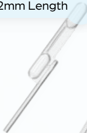
E9500-80 80µL Capacity 96mm Length