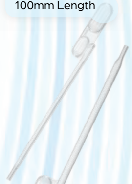
E9500-200 200µL Capacity 100mm Length